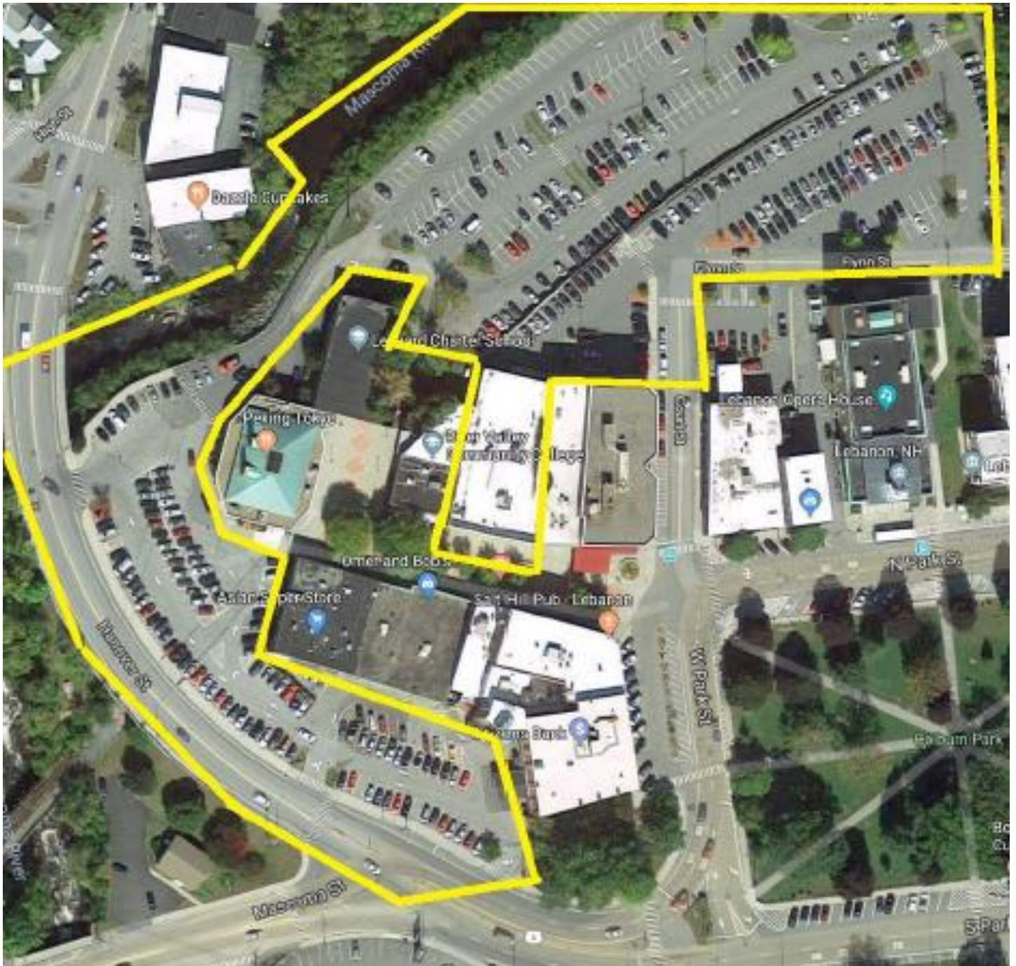
Lebanon Academic Center – 15 Hanover Street, Lebanon, NH 03766