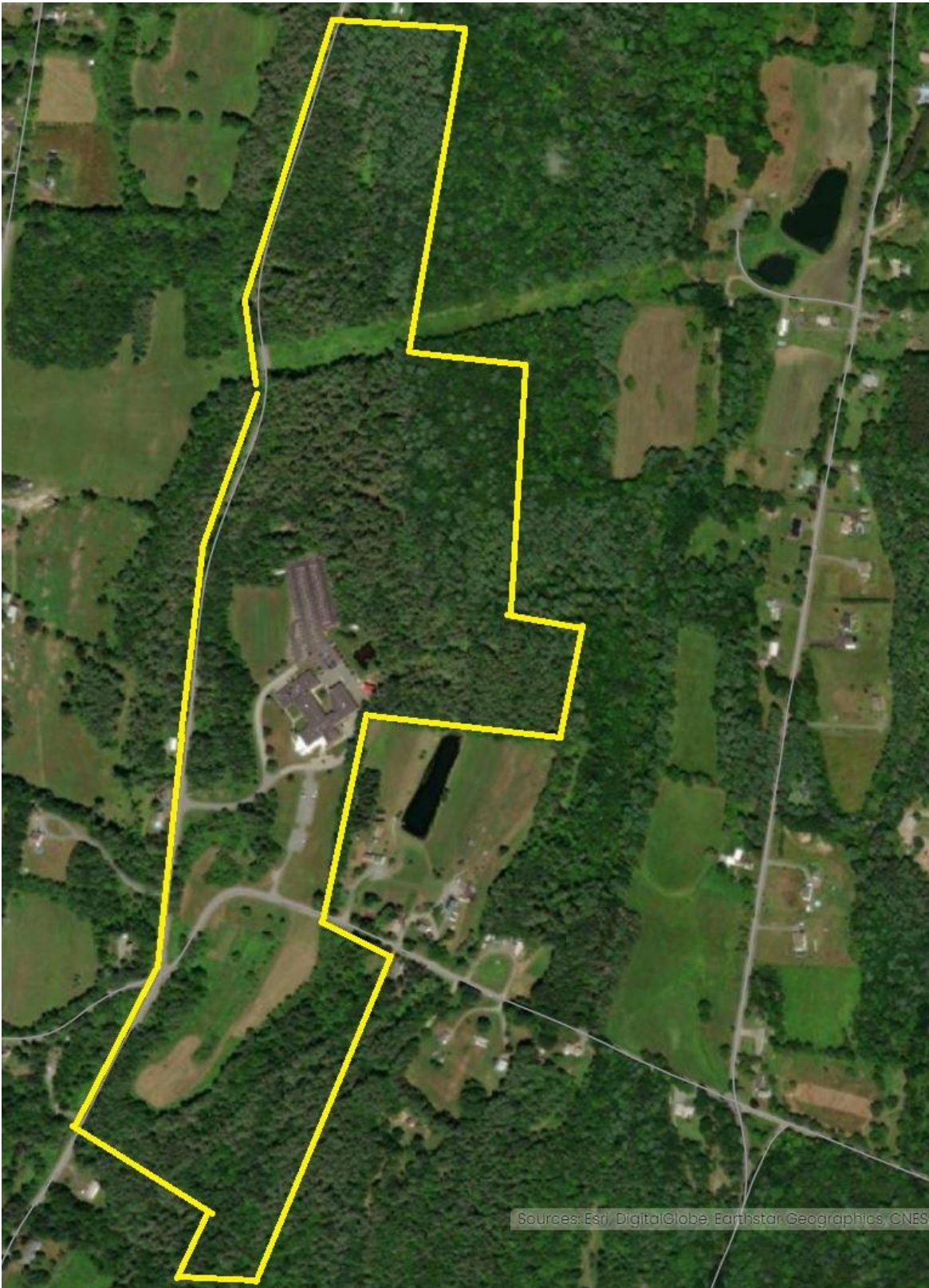
Claremont Campus – 1 College Place, Claremont, NH 03743